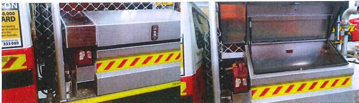
Repositioning of the jerry can to the nearside and covered to protect from falling debris.